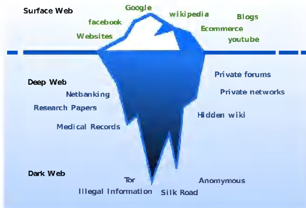
Figure 1 – A size comparison of what is available in each of the available webs [2]

The Clearnet is something that, to be accessed needs to have some sort of application like Microsoft edge, google chrome, opera, and many others out there available to the consumer and all it need it's some form of internet connection to be used.