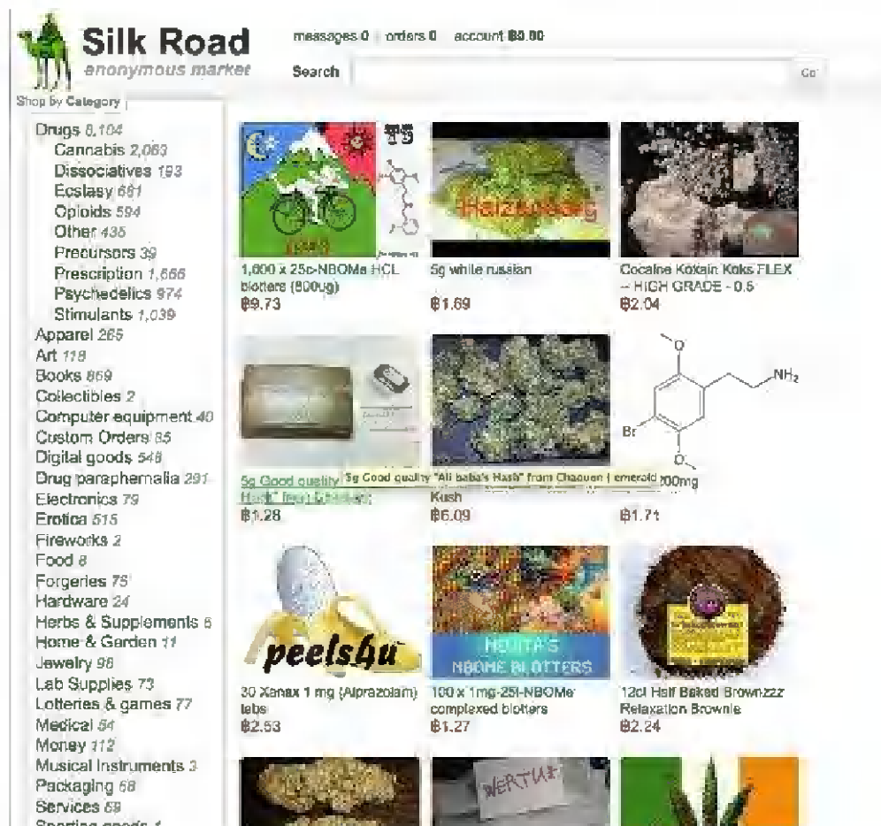
Figure 4 – Silk Road website [15]